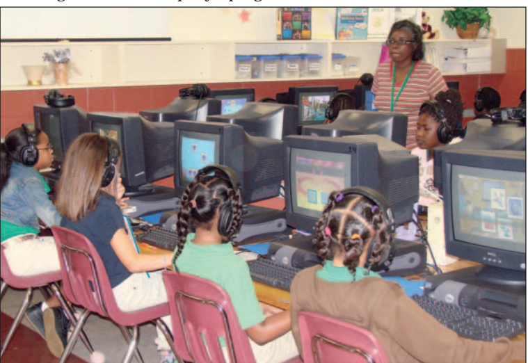
FastForWord Lab at Morven Elementary School

"The Scientific Learning Corp. has selected the Anson County School District in North Carolinas a National Reference site for its outstanding use of the company's program."